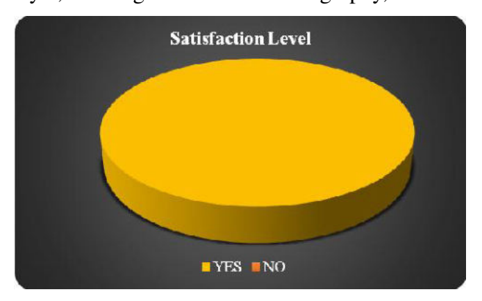
Figure 2: Satisfaction level of the respondents

to the table, include automatic file renaming, editing references to match the required citation style, creating a formatted bibliography, etc.